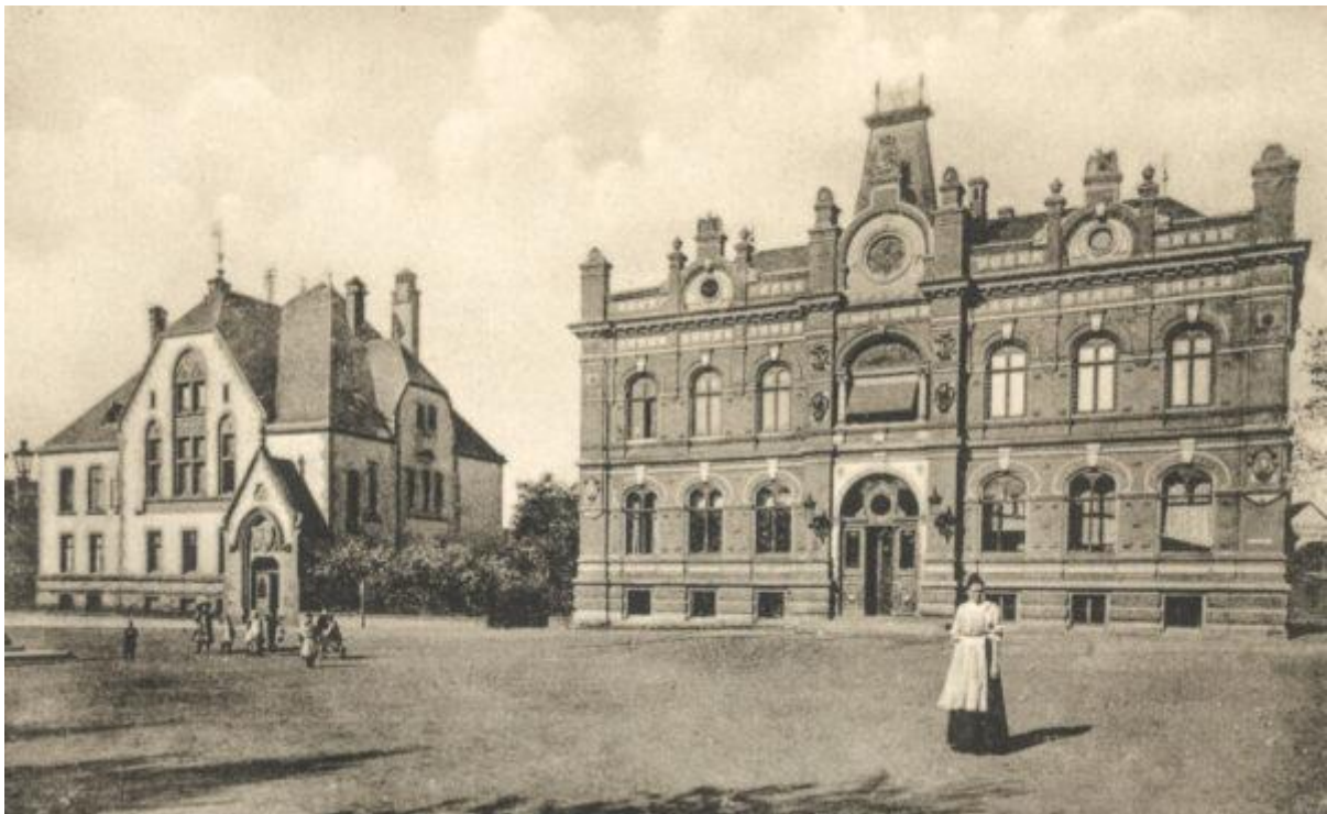
The City Hall in 1935